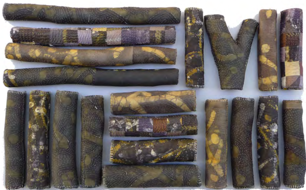
Perhaps Renewal 2012