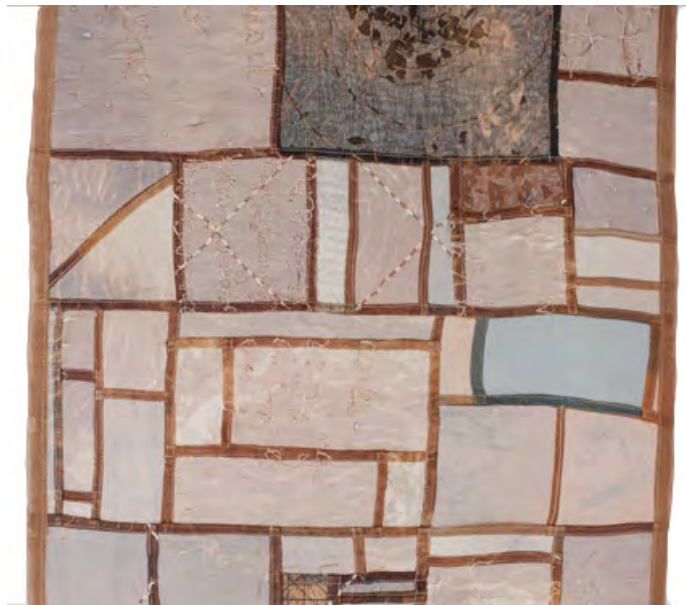
Unfolding Story (left) and detail 2013