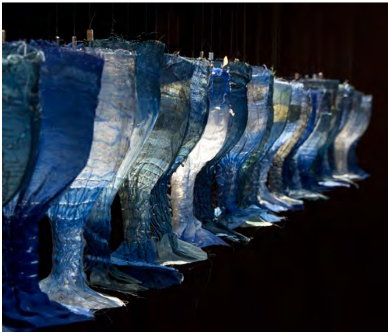
Still Life Now Breathing 2013