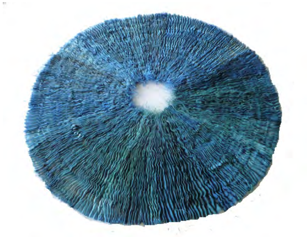
Surface Story 2013