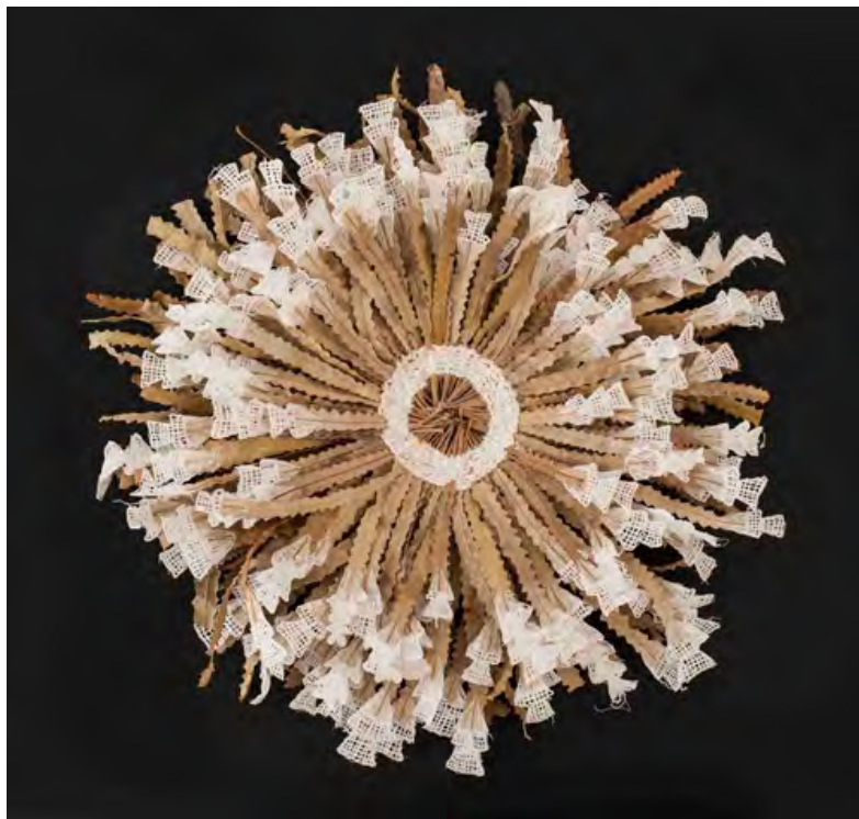
Hollow Lace 2013