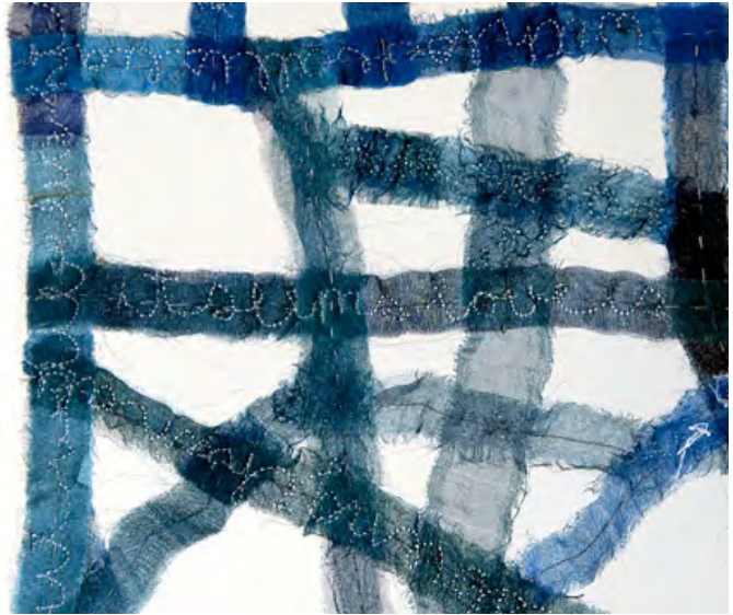
Blue Rain (left) and detail 2012