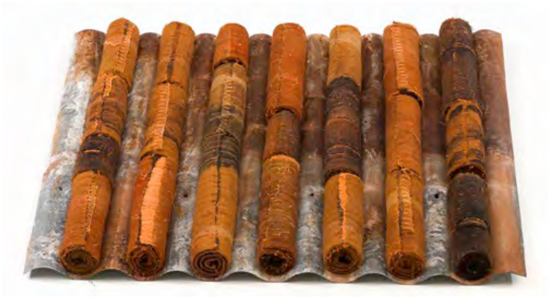
Ferrous Solution 2013