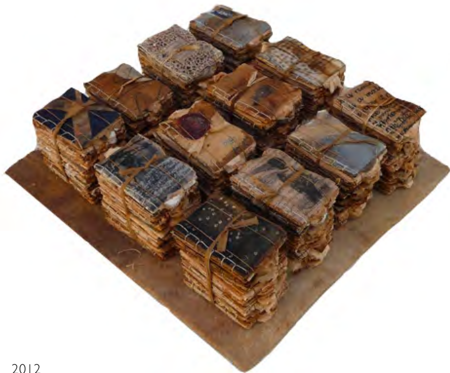
The Remnant Diaries 2012