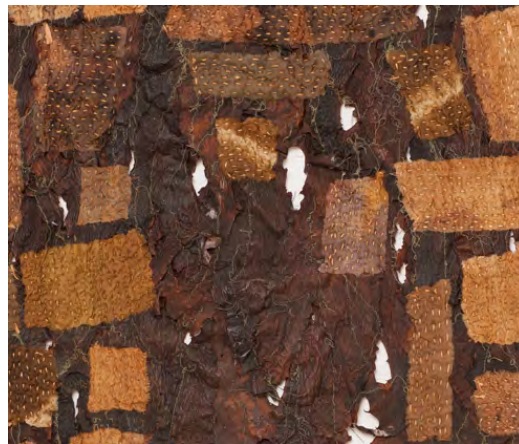
Picking up the Pieces 2012