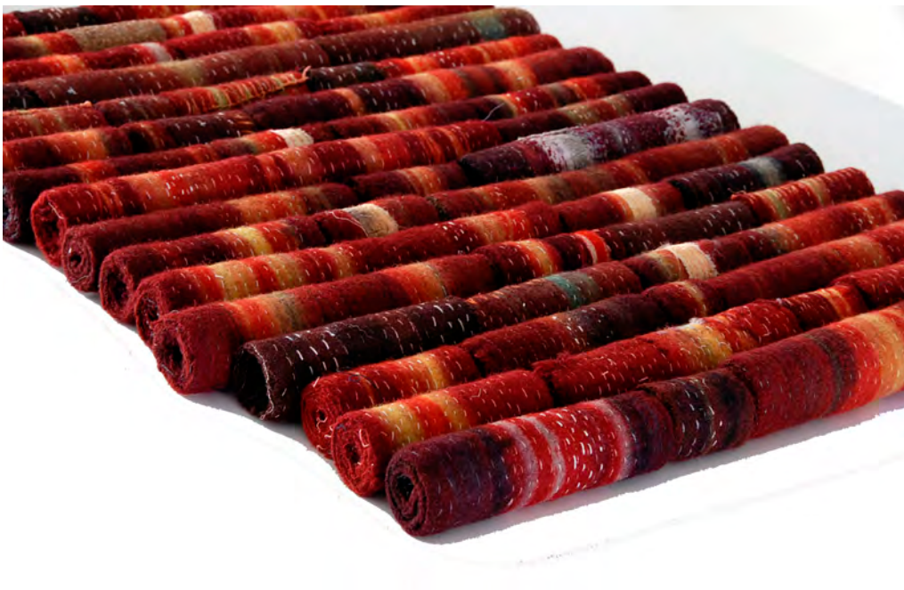
Core Beliefs (detail) 2012